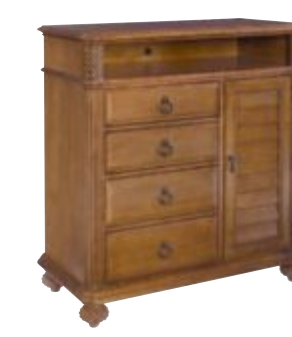
079-225 MEDIA CABINET

W46 D3 H37 (117 x 8 x 94cm) Beveled mirror, can be hung vertical or horizontal, mirror supports included. Pages:4/5, 7, 12, 16/17