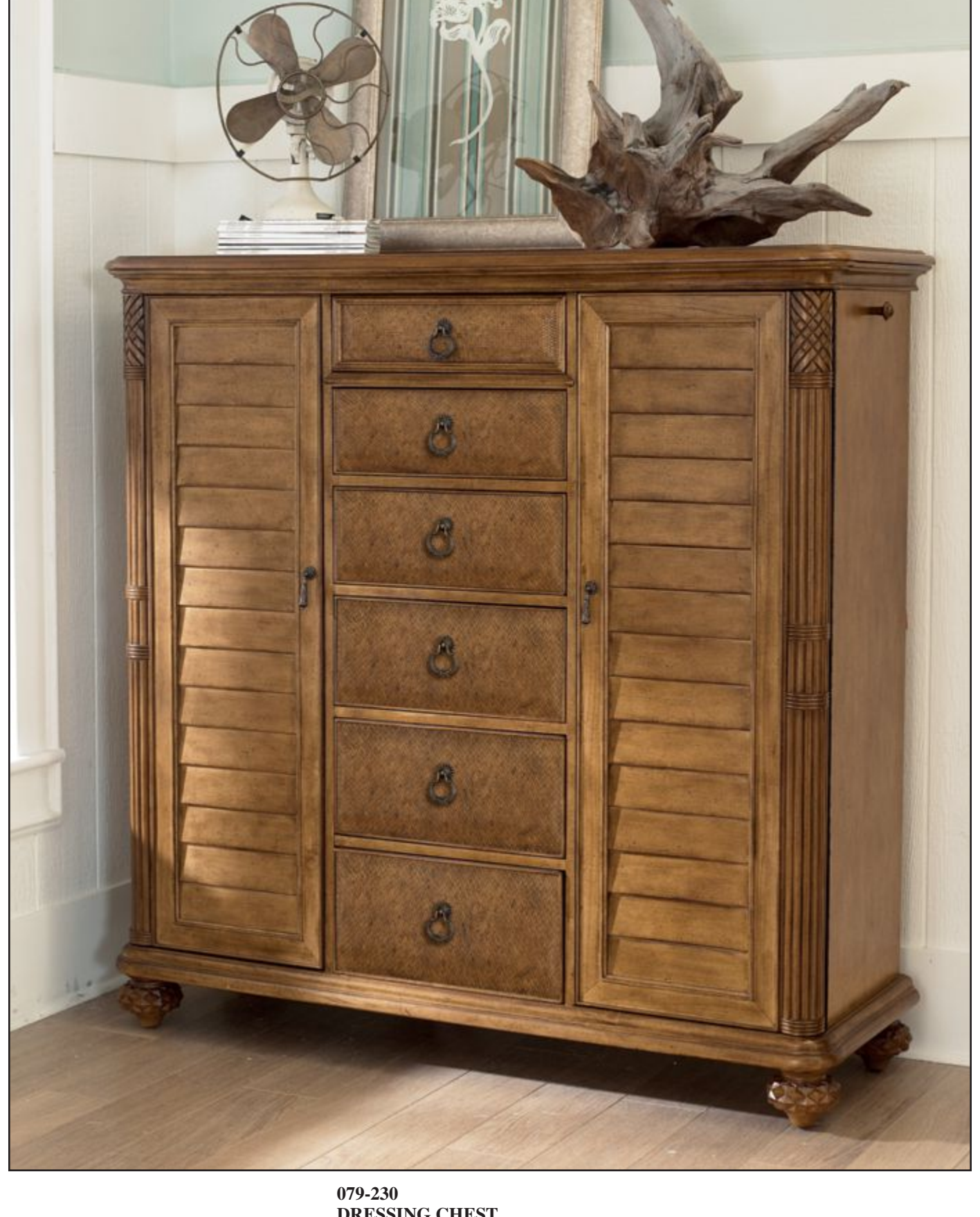
079-230 DRESSING CHEST W58 D20 H58 6 drawers in middle, 2 doors with 3 adjustable shelves behind each, 1 hanging peg on each side.