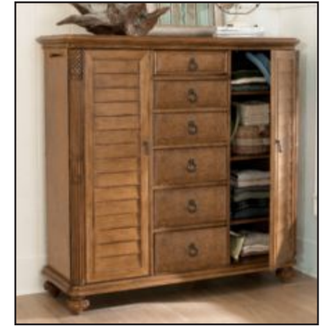
Right: 079-230 DRESSING CHEST Open detail.

above: 079-225 MEDIA CABINET W45 D21 H48 4 drawers, 1 door with 2 adjustable shelves, 1 open shelf: W37 D18 H5 ½ wire management openings.