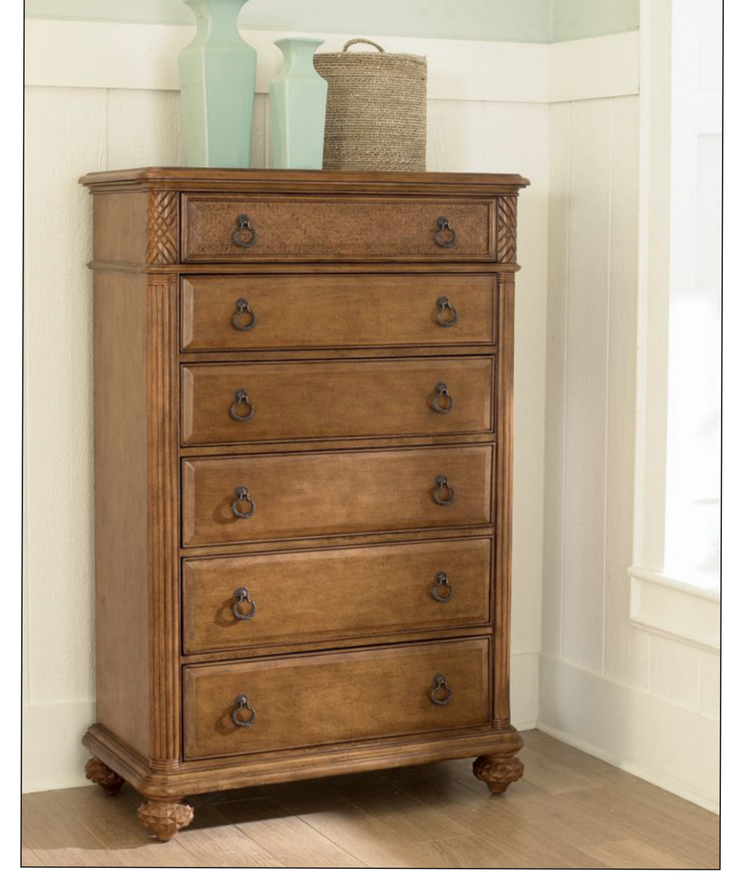
079-215 DRAWER CHEST W39 D20 H58 6 drawers.