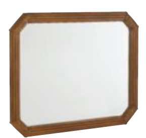
079-050 LANDSCAPE MIRROR

All illustrations and specifications in this catalog are based on the latest product information available at the time of printing. American Drew reserves the right to discontinue items without notice and to make changes to colors, materials, equipment and specifications at any time. This catalog is intended to be distributed to authorized dealers, and possession does not constitute authority to purchase.