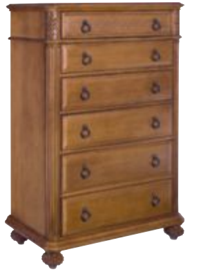
079-215 DRAWER CHEST

W39 D20 H58 (99 x 51 x 147cm) 6 drawers.