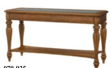
079-925 SOFA TABLE - KD W52 D17 H29 (132 x 43 x 74cm) Beveled glass insert on top. One fixed shelf. W431/2 D81/4 H161/2 (110 x 21 x 42cm) Page : 20