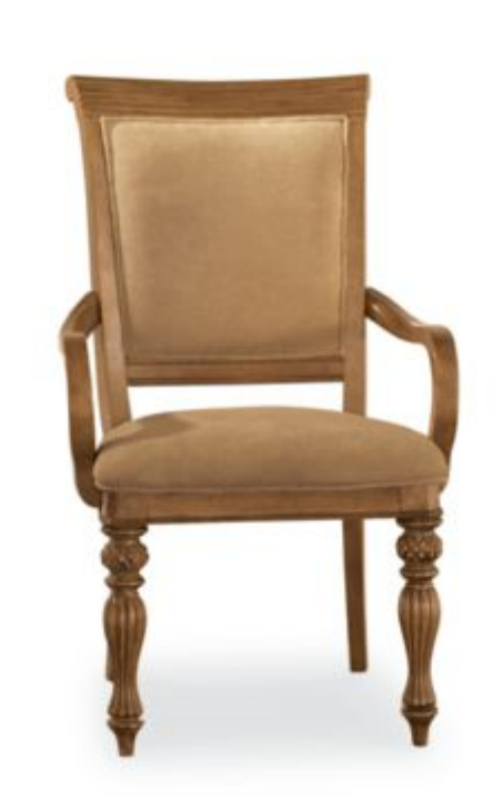
Above: 079-639 ARM CHAIR - KD W24 D27 H40 Seat H:19<sup>1</sup>/<sub>2</sub> Arm H:24<sup>1</sup>/<sub>2</sub>

Below: 079-638 SIDE CHAIR - KD W21 D27 H40 Seat H:19<sup>1</sup>/<sub>2</sub>