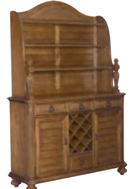
079-830R BUFFET COMPLETE W55 D18 H81 (140 x 46 x 206cm) Consists of: -830 BUFFET BASE

W55 D18 H39 (140 x 46 x 99cm) 4 drawers, silver tray in LSF top drawer, 2 doors with 1 adjustable shelf behind each, removable wine rack in middle with optional adjustable shelf, finished top.