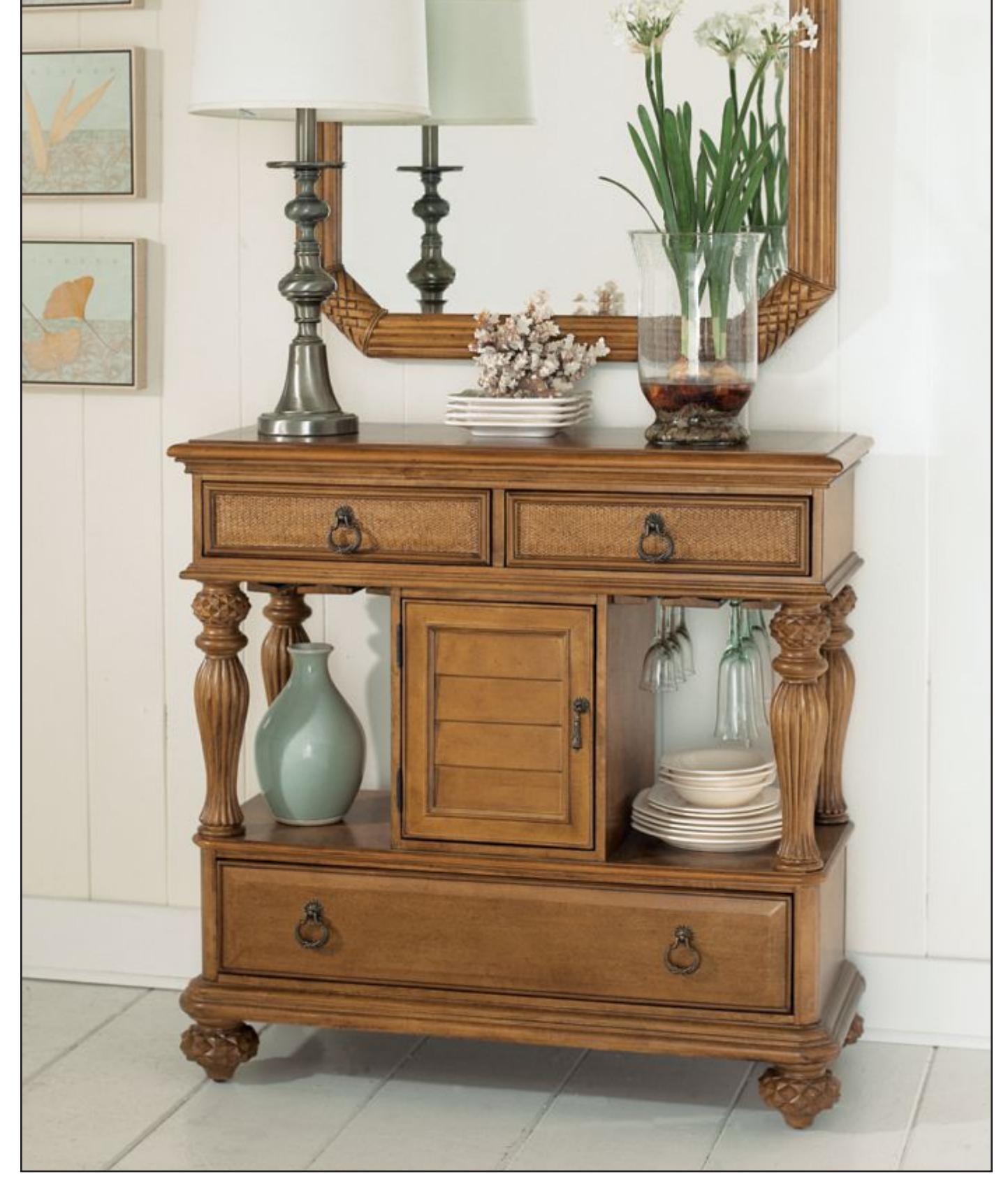
079-050 LANDSCAPE MIRROR W37 D3 H46 Beveled mirror, can be hung vertical or horizontal, mirror supports included. Shown hung vertically. 079-850 SIDEBOARD W41 D18 H40 2 small drawers on top, silver tray in LSF drawer, 1 large drawer on bottom, 1 door with 1 adjustable half shelf, wine glass storage on sides.