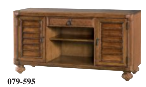
ENTERTAINMENT CONSOLE - KD W56 D20 H30 (142 x 51 x 76cm) One drawer. Open compartment in center with one adjustable shelf. W22 D19<sup>1</sup>/<sub>2</sub> H16<sup>3</sup>/<sub>4</sub> (56 x 50 x 43cm) Two side doors with one adjustable shelf behind each. Wire management openings. Page2: 22/23