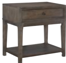
488-421 LEG NIGHTSTAND - KD W30 D19 H30 1 Drawer; Recessed area in Back for Electrical Outlet Lower Shelf: W28 D16-5/8 H14-7/8 pages: 4/5, 9, 11