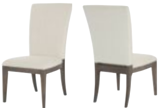
488-622 UPHOLSTERED SIDE CHAIR W20-3/4 D26-1/4 H42 Seat H19, Upholstered Seat and Back, Fabric: Sunbrella® “Sailcloth Sailor” pages: 16/17, 21