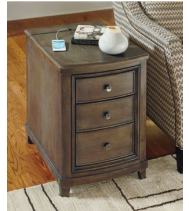
488-916 CHAIRSIDE TABLE W18-1/2 D26 H25-1/2 3 Drawers, Flip Top with Electrical Outlet with Standard and USB port for charging, Levelers