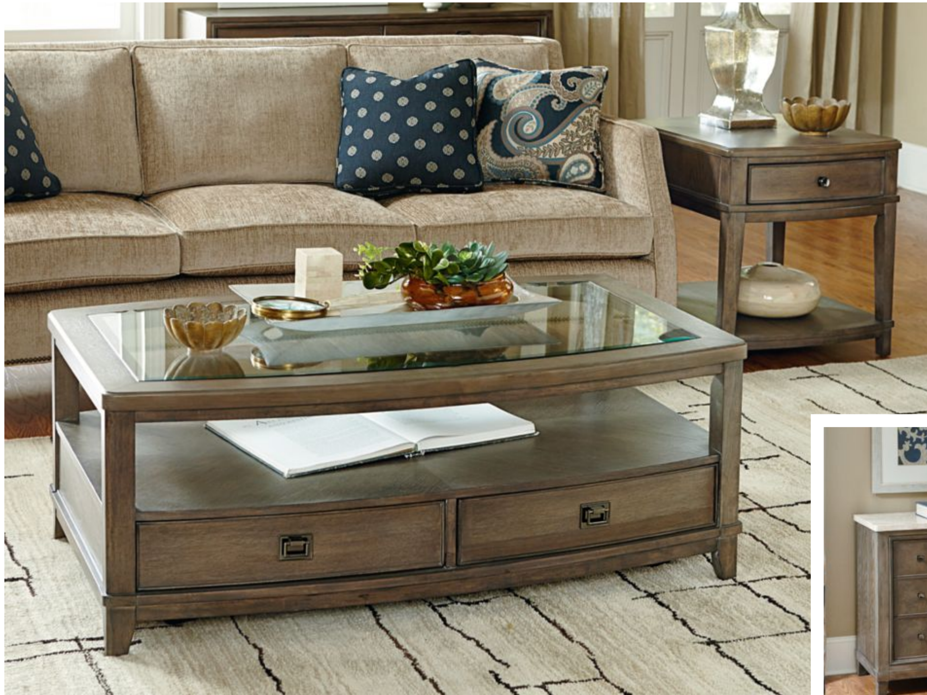
488-910 RECTANGULAR COCKTAIL TABLE-K D W50 D30 H19 2 Drawers, Tempered Glass Top, 1 Shelf, Casters, Lower Shelf Size W49 x D29