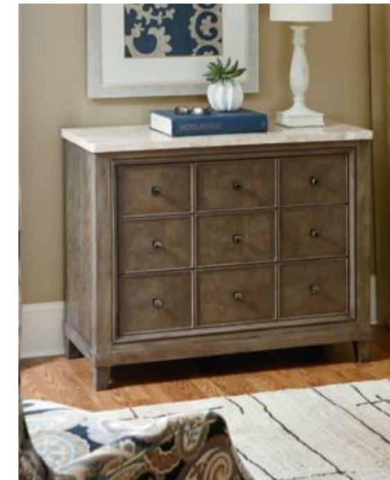
488-945 APOTHECARY HALL CHEST W43 D19 H34 3 Drawers, Stone Top (Polished Travertine)