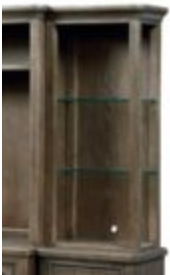
488-583 RSF ENTERTAINMENT PIER DECK W22 D13 H46 2 Adjustable Glass Shelves, Cord Exits, Puck Light with Touch Dimmer pages: 22/23