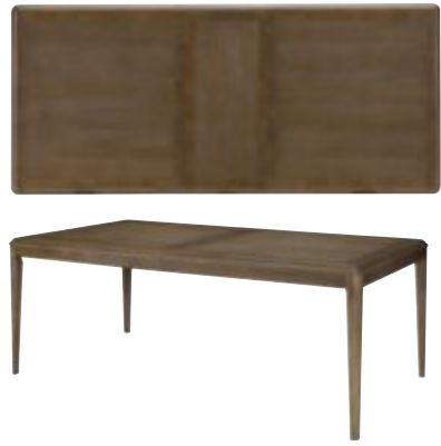
488-760 RECTANGULAR DINING TABLE W76 D42 H30 Includes 1-18" Leaf, Adjustable Levelers, Overall size with 18" leaf in place: W94 D42 H30 page: 12/13