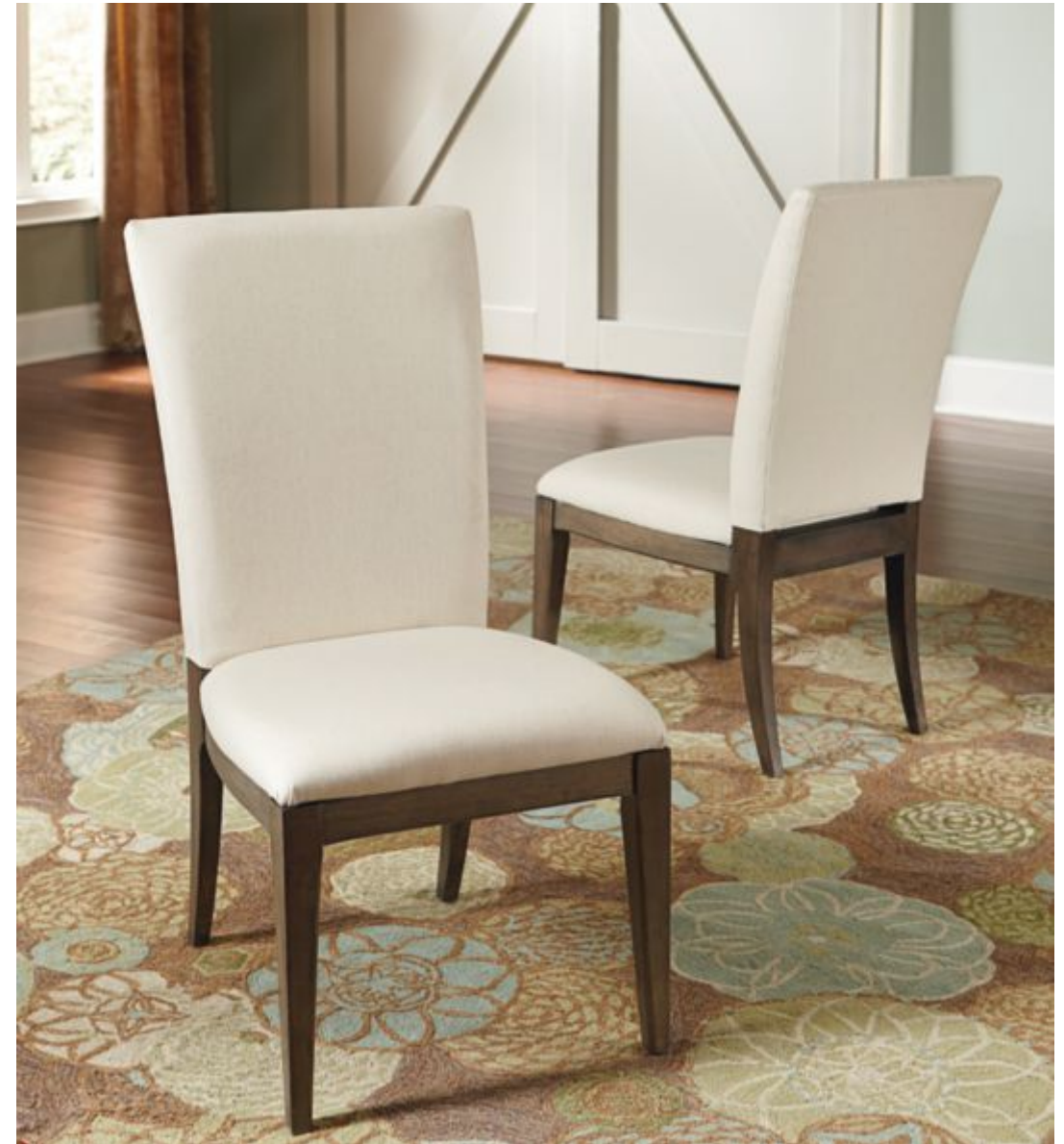
488-622 U PHOLSTERED SIDE CHAIR W20-3/4 D26-1/4 H42 Seat H19, Upholstered Seat and Back, Fabric: Sunbrella® "Sailcloth Sailor"