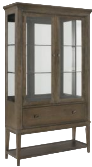
488-855 CURIO CHINA W46 D16 H80 2 Doors, 1 Drawer With Divider, 2 Adjustable Glass Shelves with Plate Grooves and Mirrored Back, Felt Lined Tray in Drawer, Puck Light with Touch Feature, Lower Shelf: W41 D12-1/2 H10-7/16, Adjustable Levelers page: 14