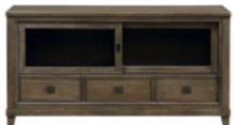
488-585 ENTERTAINMENT CONSOLE W66 D19 H34 3 Drawers, 2 Sliding Glass Doors with 2 Adjustable Glass Shelves, Cord Exits, Electrical Outlet, Removable Magnetic Back Panel, Area Behind Door Without Shelf: W31-1/2 D14-1/2 H17, Levelers pages: 22/23