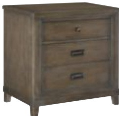
488-420 NIGHTSTAND W30 D19 H30 3 Drawers; Recessed area in Back for Electrical Outlet, Levelers pages: 9, 10/11

Consists of: -306 UPHOLSTERED SLEIGH HEADBOARD 6/0-6/6 W86 D9 H58 Bored For Frame, Fabric: Sunbrella® “Sailcloth Sailor” -338 STORAGE FOOTBOARD 6/0-6/6 W81 D21 H18 2 Cedar Lined Drawers -R53 STORAGE RAILS 6/0 W86 D4 H14