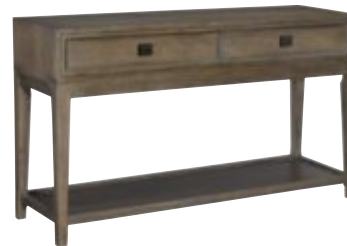
488-925 CONSOLE TABLE-K D W56 D17 H33 2 Drawers, Lower Wood Shelf, Top Right Side Facing Drawer is a Flip-Down Pull- Out Drawer - size: W23-7/16 D14 H3-3/8, Lower Shelf Size W54 D14-3/4 H17-7/8 page: 22