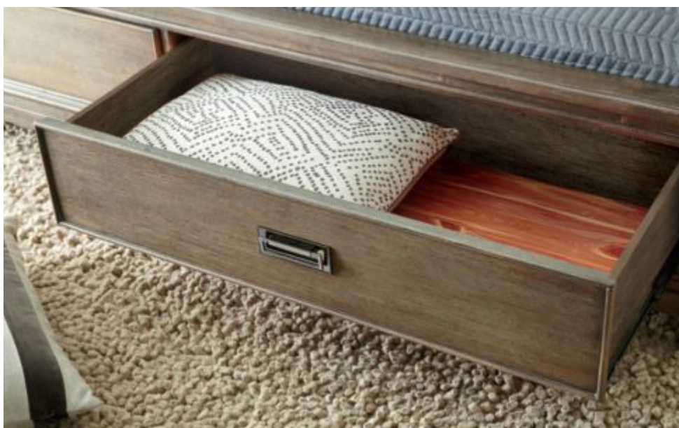
488-337 QUEEN STORAGE FOOTBOARD 5/0 W65-1/4 D20-5/8 H17-1/2 2 Drawers With Cedar Lined Bottoms

OPPOSITE PAGE: 488-215 DRAWER CHEST W42 D19 H59 7 Drawers, Cedar Lined Bottom Drawer, Cut- outs in Back of Case for Lifting, Lower Shelf, Adjustable Levelers, Lower Shelf size: W39 D16 H10