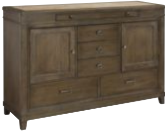
488-850 BUFFET W62 D19 H42-1/2 5 Drawers, 2 Doors, 1 Adjustable Shelf, Laminate Pull-Out Shelf, Silverware Tray in Top Center Drawer, Adjustable Center Foot, Area Behind Door Without Shelf: W20 D16-3/4 H21-7/16, Adjustable Levelers pages: 12/13, 15, 16/17