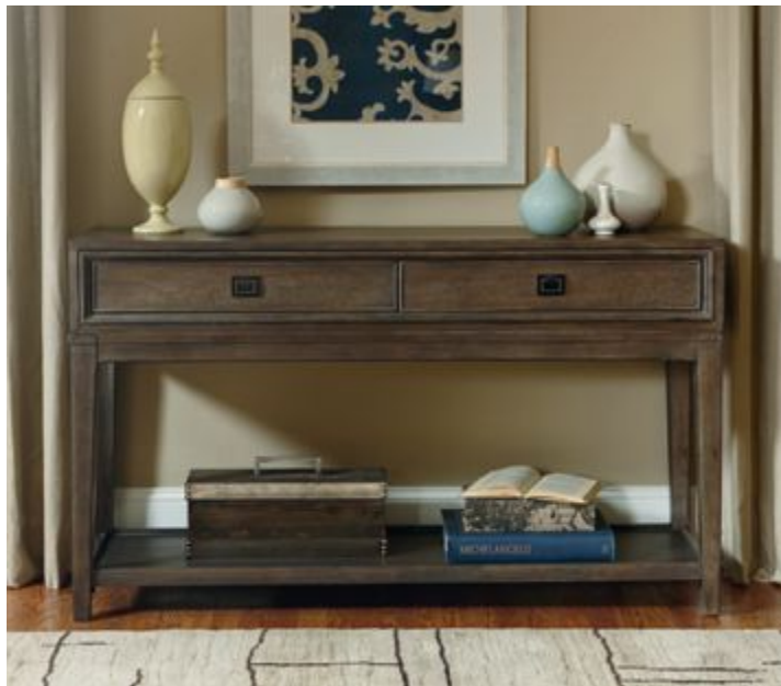
488-925 CONSOLE TABLE-K D W56 D17 H33 2 Drawers, Lower Wood Shelf, Top Right Side Facing Drawer is a Flip-Down Pull-Out Drawer - size: W23-7/16 D14 H3-3/8, Lower Shelf Size W54 D14-3/4 H17-7/8