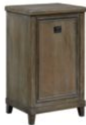
488-580 LSF ENTERTAINMENT PIER BASE W20 D16 H34 1 Door With 1 Adjustable Shelf, Electrical Outlet Behind Door, Area Behind Door without Shelf: W17-5/8 D13-1/4 H25-7/16 Levelers pages: 22/23