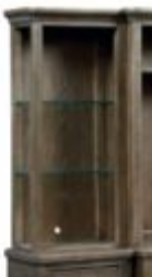
488-581 LSF ENTERTAINMENT PIER DECK W22 D13 H46 2 Adjustable Glass Shelves, Cord Exits, Puck Light with Touch Dimmer pages: 22/23