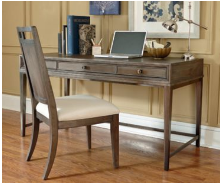
488-940 WRITING DESK W60 D27 H31 3 Drawers, Center Drawer is a Flip Down Pull-Out Drawer W21 D18 H2, Cord Exit in Back, Inset Bicast Leather Insert, Knee Hole W56-1/2 x D26-3/8 x H23-15/16