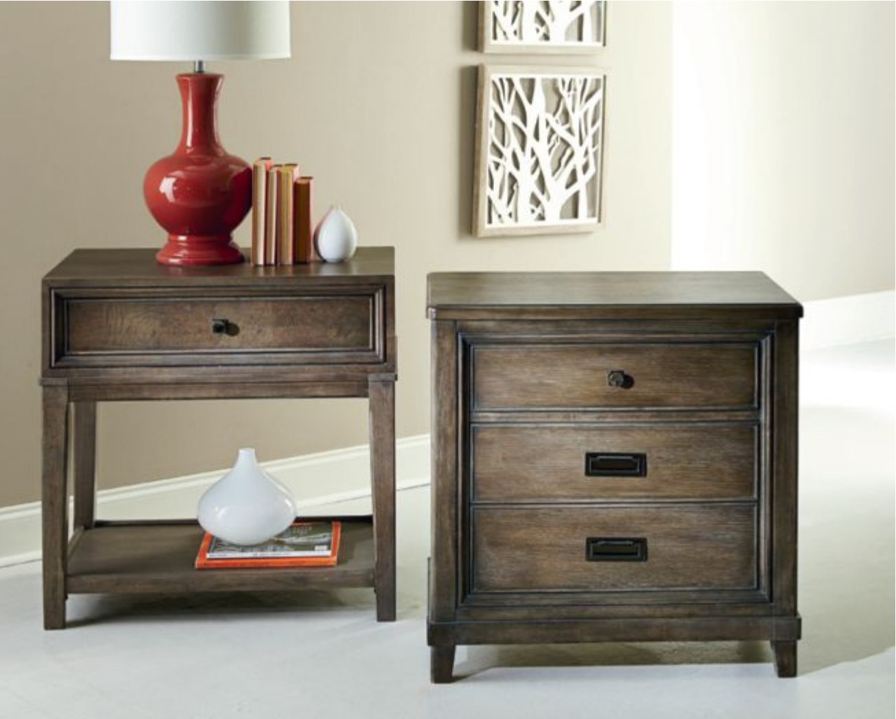
488-421 LEG NIGHTSTAND - KD W30 D19 H30 1 Drawer; Recessed area in Back for Electrical Outlet, Levelers Lower Shelf: W28 D16-5/8 H1-1/4 Opening Above Shelf: 14-7/8