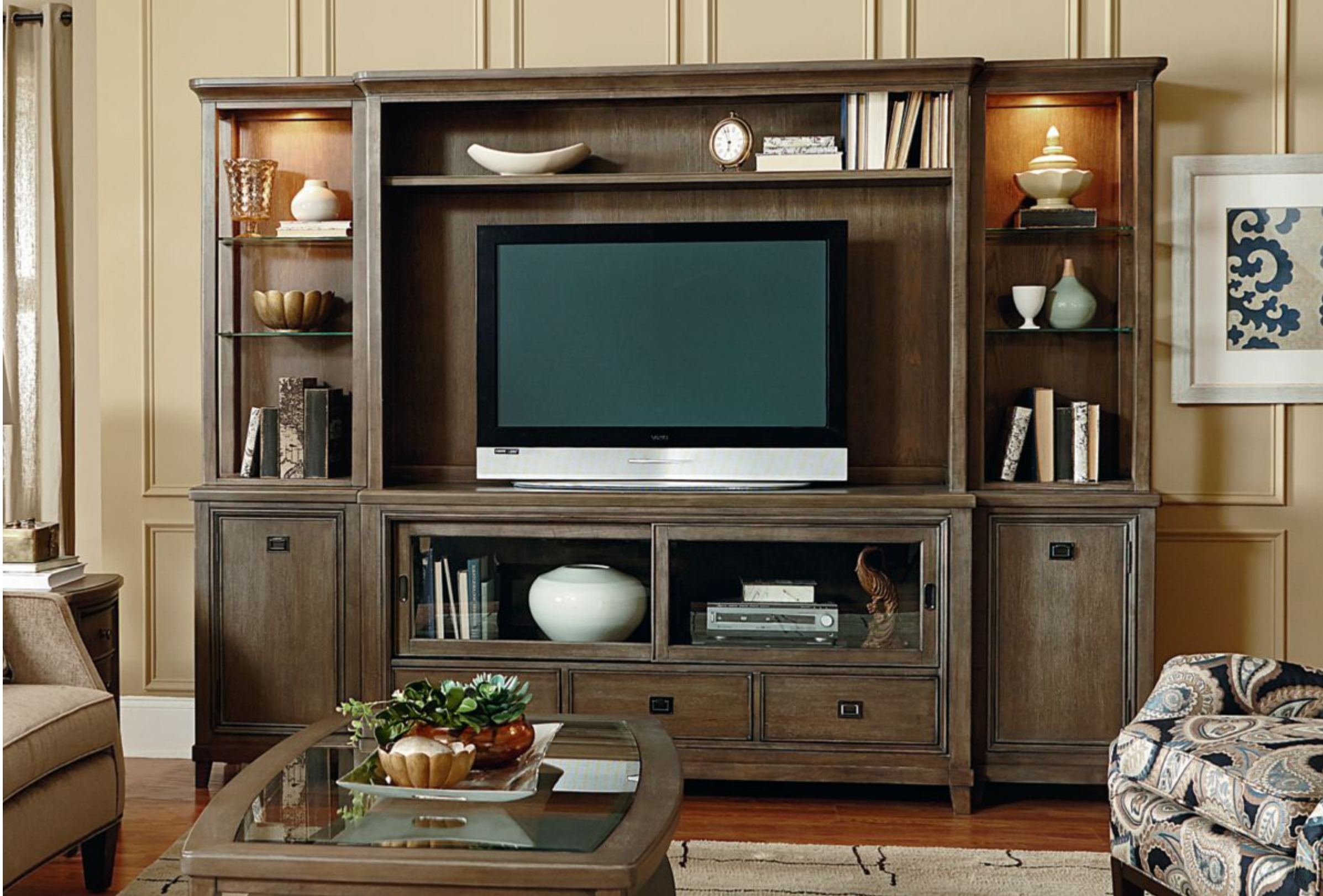
488-580 LSF ENTERTAINMENT PIER BASE W20 D16 H34 1 Door With 1 Adjustable Shelf, Electrical Outlet Behind Door, Area Behind Door without Shelf: W17-5/8 D13-1/4 H25-7/16, Levelers