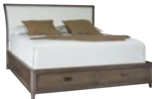
488-338R UPHOLSTERED SLEIGH BED WITH STORAGE 6/6

Consists of: -304 UPHOLSTERED SLEIGH HEADBOARD 5/0 W70 D9 H58 Bored For Frame, Fabric: Sunbrella® “Sailcloth Sailor” -337 STORAGE FOOTBOARD 5/0 W65 D21 H18 2 Cedar Lined Drawers -R52 STORAGE RAILS 5/0-6/6 W82 D3 H14 page: 6