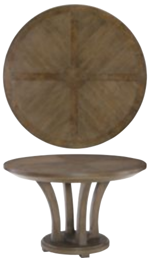
488-701R ROUND DINING TABLE DIA. 48 H30 Consists of: -701 ROUND DINING TABLE TOP 48” W48 D48 H3-1/2 -B01 DINING TABLE BASE W32-1/2 D32-1/2 H28-3/4 Adjustable Levelers pages: 16