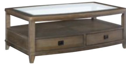
488-910 RECTANGULAR COCKTAIL TABLE-K D W50 D30 H19 2 Drawers, Tempered Glass Top, 1 Shelf, Casters, Lower Shelf Size W49 x D29 page: 24/25