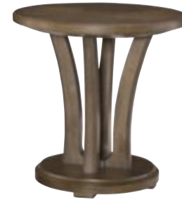
488-918 ROUND LAMP TABLE-K D DIAMETER 26 H26 Adjustable Levelers page: 25