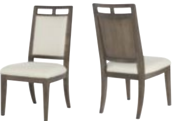
488-636 WOOD BACK SIDE CHAIR W20 D25 H41 Seat H19, Upholstered Seat and Back Fabric: Sunbrella® “Sailcloth Sailor” pages: 12/13, 20, 22