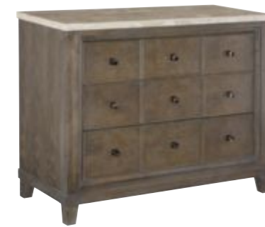
488-945 A POTHECARY HALL CHEST W43 D19 H34 3 Drawers, Stone Top (Polished Travertine) page: 25