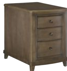
488-916 CHAIRSIDE TABLE W18-1/2 D26 H25-1/2 3 Drawers, Flip Top with Electrical Outlet with Standard and USB port for charging, Levelers page: 25