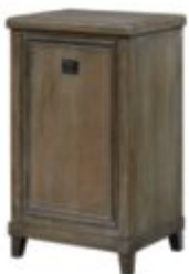
488-582 RSF ENTERTAINMENT PIER BASE W20 D16 H34 1 Door With 1 Adjustable Shelf, Electrical Outlet Behind Door, Area Behind Door without Shelf: W17-5/8 D13-1/4 H25-7/16 Levelers pages: 22/23