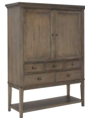
488-891 BAR CABINET W49 D19 H67-7/8 2 Doors, 5 Lined Drawers, 2 Adjustable Glass Shelves, Bottle Storage, Puck Light, Mirrored Back, Laminate Pullout Serving Surface, Lower Shelf Size W44 D15-1/2 H11- 3/4, Levelers pages: 18/19