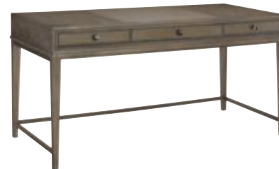
488-940 WRITING DESK W60 D27 H31 3 Drawers, Center Drawer is a Flip Down Pull-Out Drawer W21 D18 H2, Cord Exit in Back, Inset Bicast Leather Insert, Knee Hole W56-1/2 x D26-3/8 x H23-15/16 page: 22