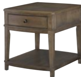
488-915 RECTANGULAR END TABLE-K D W23 D27 H25 1 Drawer, 1 Shelf, Shelf Size: W20- 1/2 D24-1/2 H12-7/8, Levelers page: 24/25