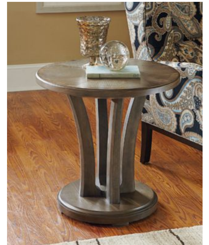
488-918 ROUND LAMP TABLE-K D DIAMETER 26 H26, Adjustable Levelers