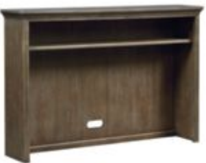
488-586 ENTERTAINMENT HUTCH W68-1/8 D16 H46 1 Adjustable Wood Shelf, Cord Exits, Shelf has 5 Adjustment Holes that are 1-1/2in apart, from Bottom of Shelf to Top of Entertainment H33-3/4 in pages: 22/23