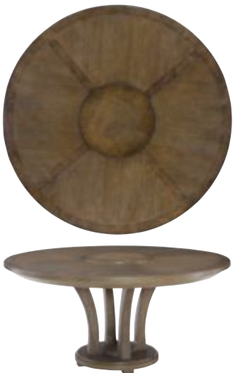
488-702R ROUND DINING TABLE DIA. 62 H30 Consists of: -702 ROUND DINING INSET LAZY SUSAN TABLE TOP 62” W62 D62 H3-1/2 -B01 DINING TABLE BASE W32-1/2 D32-1/2 H28-3/4 Adjustable Levelers pages: 16/17