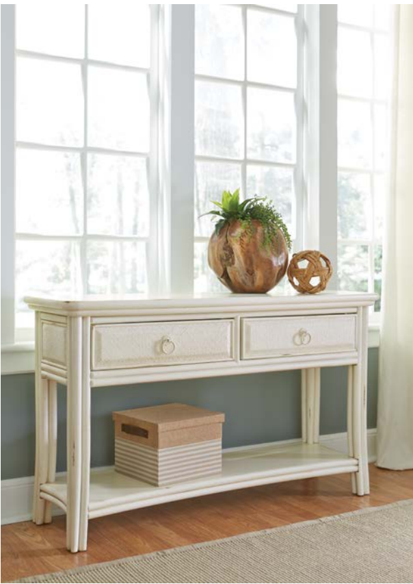
508-925 SOFA TABLE W50 D16 H30 One Fixed Shelf, Adjustable Levelers, 2 drawers, Fixed Shelf Size: W47 D13 H13-7/8