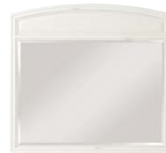
508-021 LANDSCAPE MIRROR W46 D1-15/16 H42-1/2 Beveled Mirror, Mirror Supports and Hangers pages: 4/5