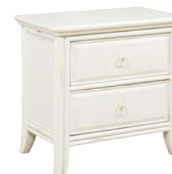
508-420 NIGHTSTAND W29 D18 H28 Two drawers; Recessed Area in Back with a Three Outlet Plug, Adjustable Levelers pages: 3, 4/5, 6