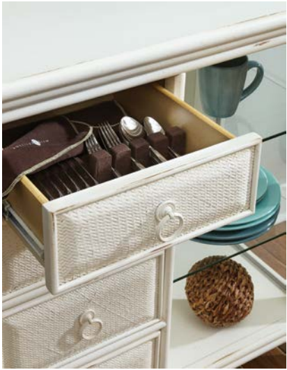
508-850 SERVER (drawer detail)