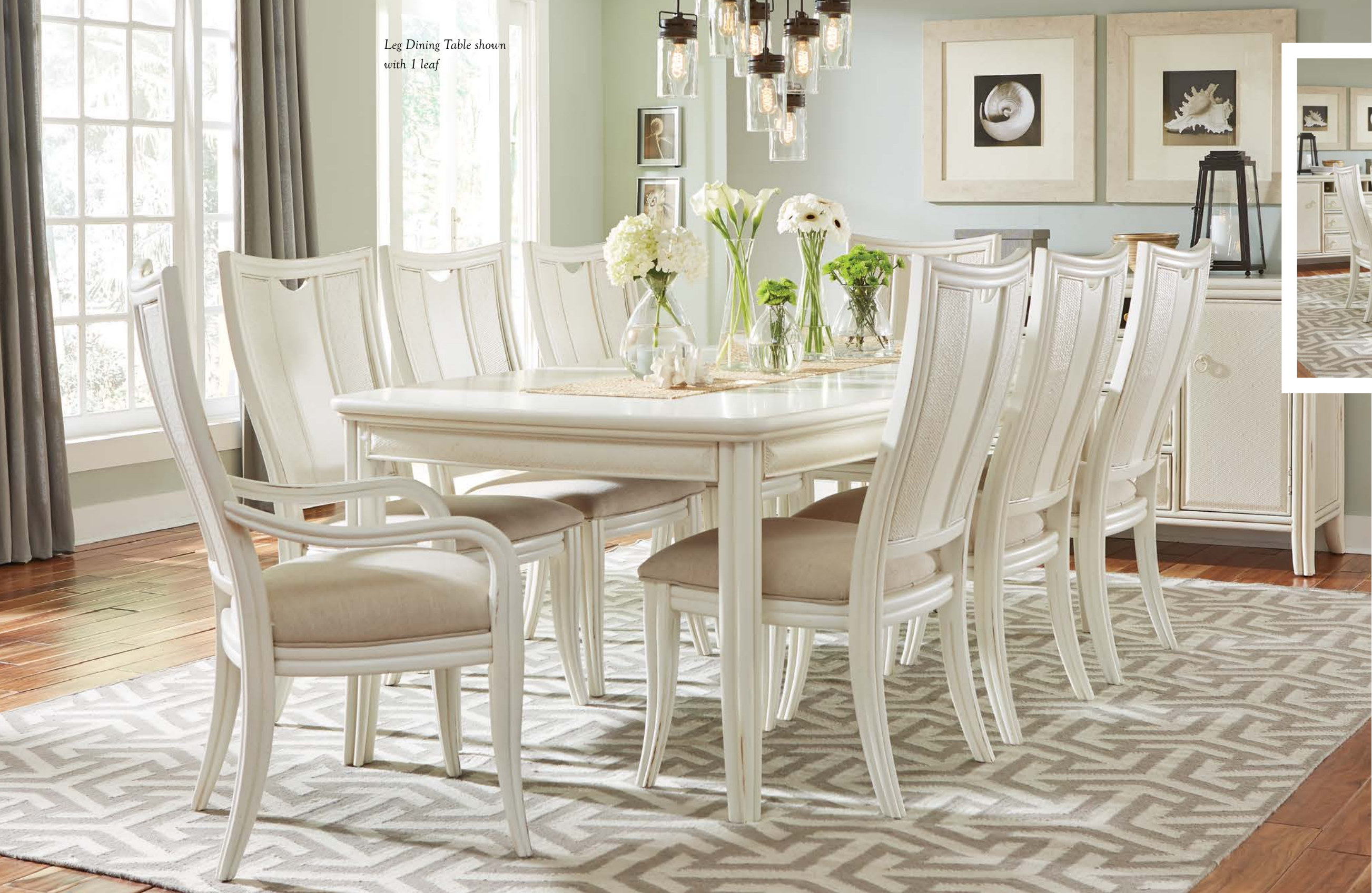
Leg Dining Table shown with 1 leaf