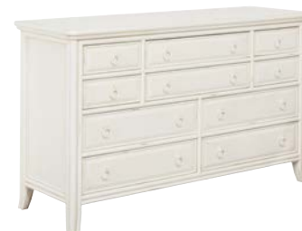
508-130 DRAWER DRESSER W64 D21 H39 Ten drawers; Brown Jewelry Tray in Top Left Drawer, Inserts for Mirror Supports on Back of Case, Adjustable Levelers; Center Foot, Hand Holds, Cedar Lined Bottom Drawers pages: 4/5