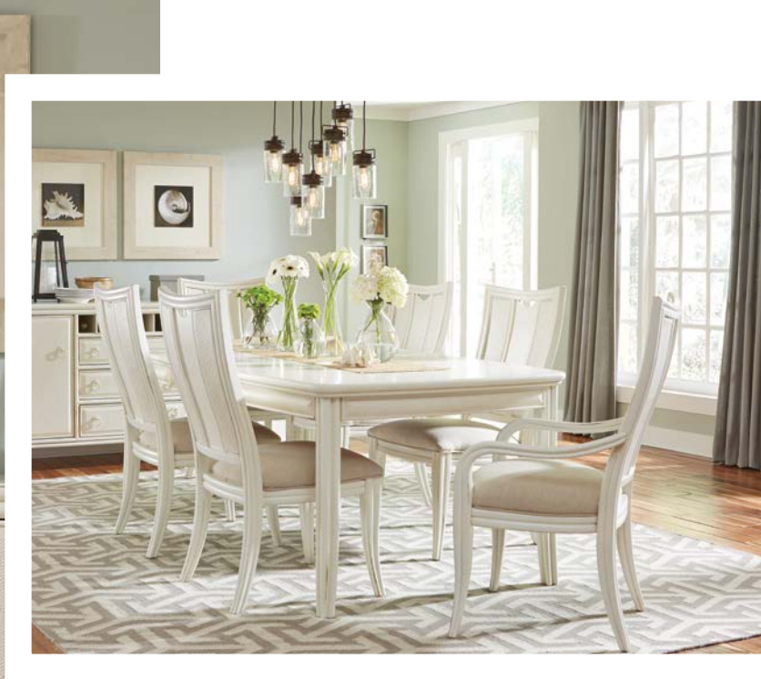
Leg Dining Table shown with no leaf

W64 D44 H30 Adjustable levelers, Overall size with 1-20" leaf: W84 D44 H30 Table shown with 1 leaf