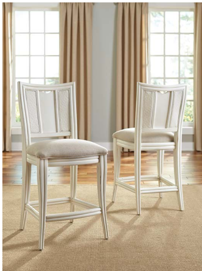
508-690 BAR STOOL W18 D20-5/8 H40 Upholstered Seat JLA Fabrics - Color: Oat, Name: Larkin, Seat Height: 24-13/16, Seat Depth: 16