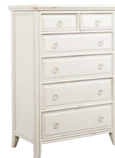
508-215 DRAWER CHEST W38 D21 H54 Six Drawers, Cedar Lined Bottom Drawer, Adjustable Levelers, Hand Holds pages: 7