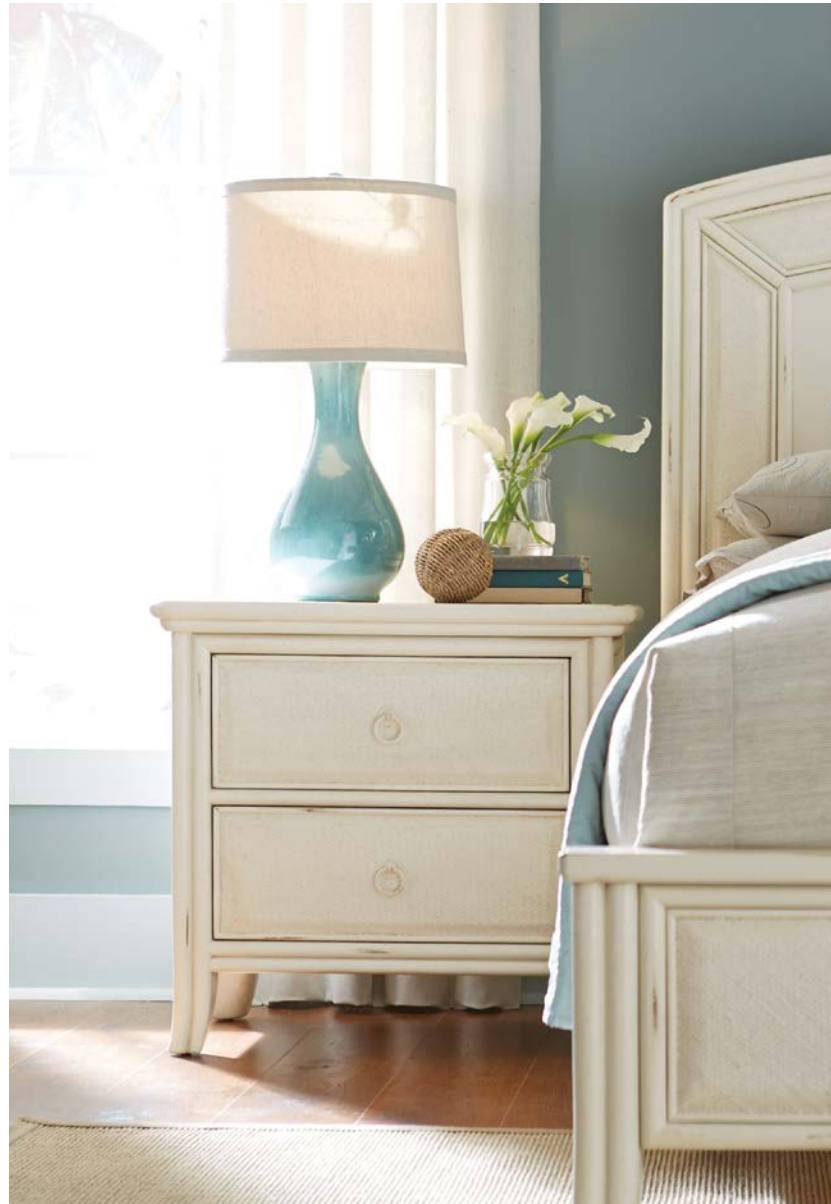
508-420 NIGHTSTAND W29 D18 H28 Two drawers; Recessed Area in Back with a Three Outlet Plug