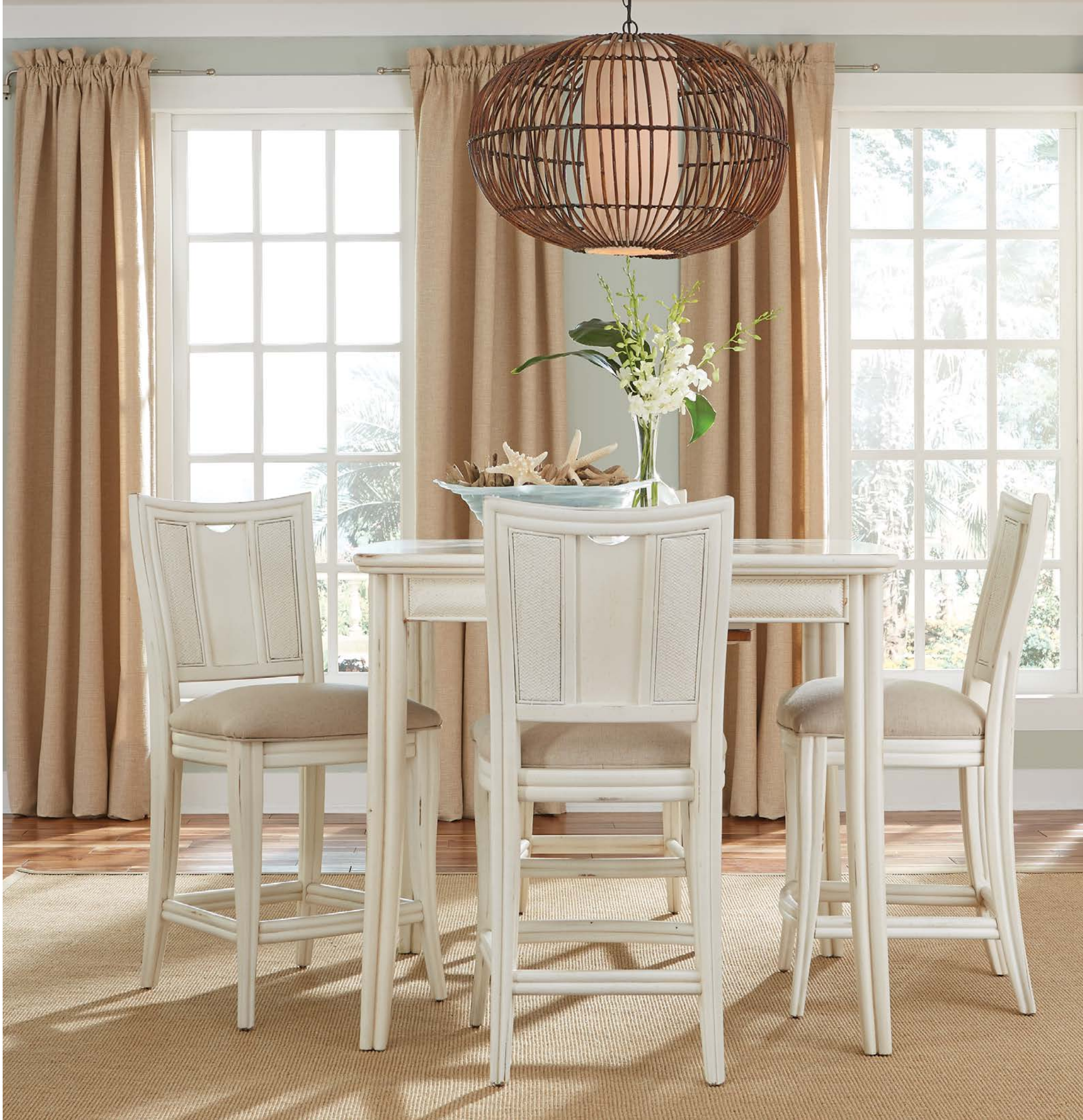
508-705 DINING TABLE W42 D42 H36 Adjustable levelers, Overall size with 1-20in leaf: W62 D42 H36