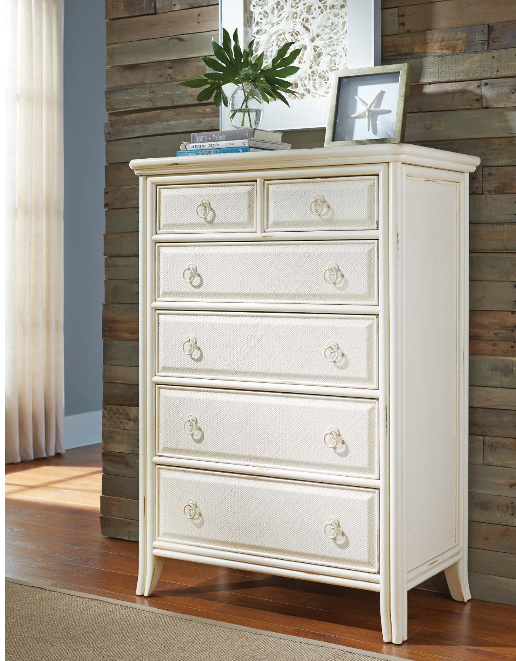
OPPOSITE PAGE: 508-215 DRAWER CHEST W38 D21 H54 Six Drawers, Cedar Lined Bottom Drawer, Adjustable Levelers, Hand Holds