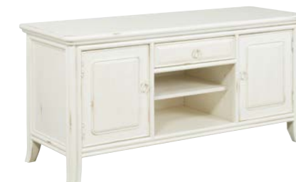
508-585 ENTERTAINMENT CONSOLE W60 D20-1/2 H29-1/4 One Drawer, 2 Doors; One Adjustable Shelf, Center Foot, Adjustable Levelers, Cord exit, 2 Component openings, Removable Magnetic Back Panel, Hand Holds, Electric Outlet Area Behind Door without shelf: W16-3/8 D17 H19-3/8 Adjustable Shelf size: W20-3/8 D16-1/2 H12-3/4 Component Opening without shelf: W20-3/8 D16-1/2 H12-3/4 pages: 19