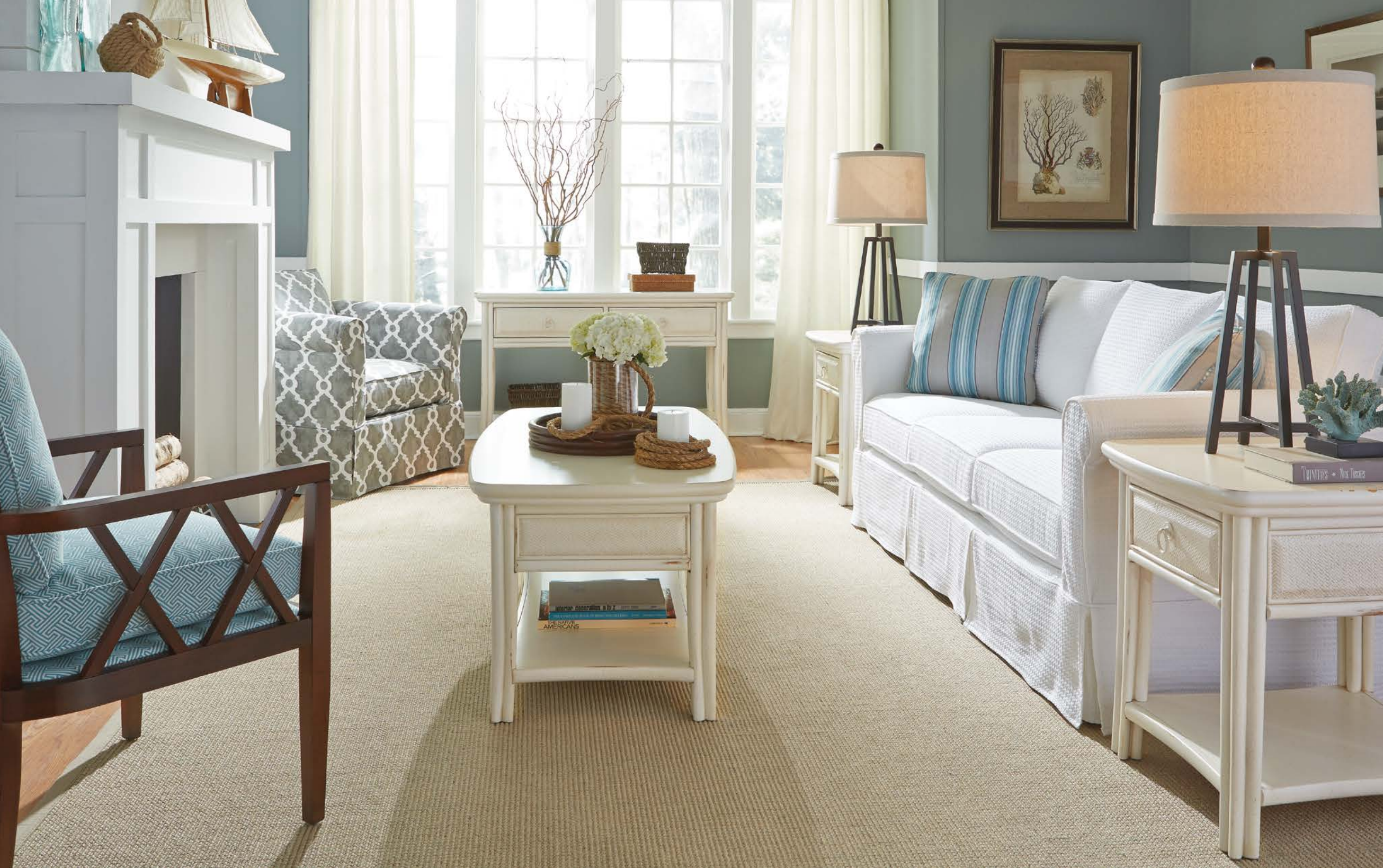
508-910 RECTANGULAR COCKTAIL TABLE W48 D26 H20-13/16 Lower Shelf