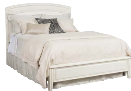
508-336R PANEL BED 6/6 W80 D88-7/16 H63 Consists of:

-SKI MATTRESS SUPPORT SYSTEM pages: 3, 4/5