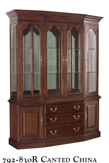
W665/8 D20 H84 Consists of: -830* Canted China Base W647/16 D19 H29 Two doors, three drawers, silver tray, one adjustable shelf behind each door