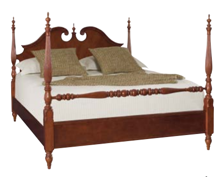
791-383R Low Poster Bed 5/0 W67 H61 Consists of:

-SK1 MATTRESS SUPPORT SYSTEM *NOTE: Pediment poster headboards cannot