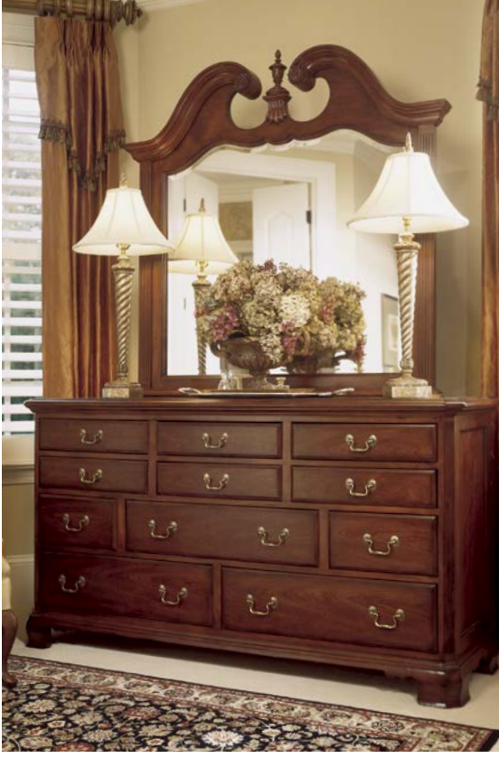
791-021 LANDSCAPE MIRROR W50 D2¾ H49 Beveled mirror