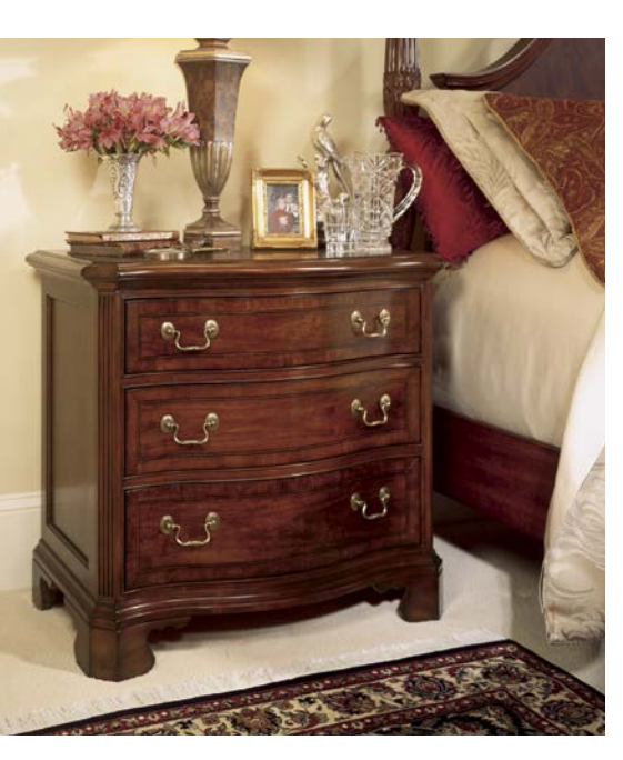
791-421 N IGHTSTAND W34 D20 H31<sup>5</sup>/8 Three drawers

791-378R PEDIMENT POSTER BED 6/6 W<sub>79</sub> H88