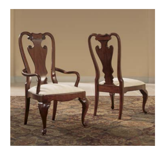
792-636 SPLAT BACK SIDE CHAIR - KD W_{24}^{5/8} D27 ^{7/16} H43