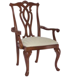
792-655 PIERCED BACK ARM CHAIR - KD W27<sup>5</sup>/16 D24<sup>9</sup>/16 H41<sup>1</sup>/<sub>2</sub> Seat height: 19 Arm height: 24 pages: 18/19