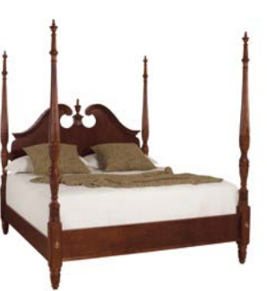
791-375R PEDIMENT POSTER BED 5/0 W65 H88 Consists of:

*NOTE: Mansion Bed headboards cannot be sold separately