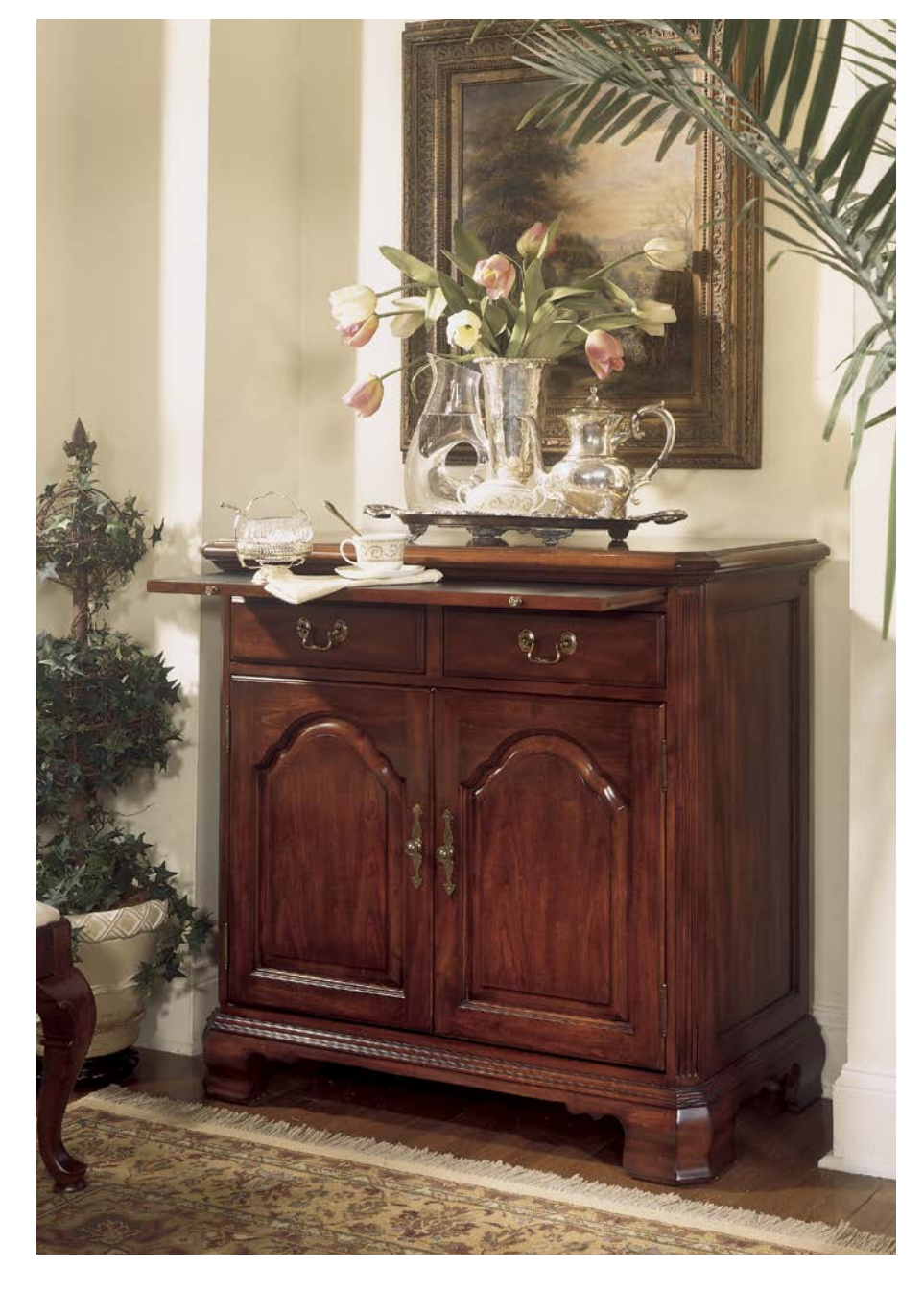
792-890 SERVER W40 D20 H38 Two doors, two drawers, One adjustable shelf, one pullout shelf, two silver trays, adjustable levelers

Opposite Page: 792-830R Canted China W665/8 D20 H84 Consists of: -830* Canted China Base W647/16 D19 H29 Two doors, three drawers, silver tray, one