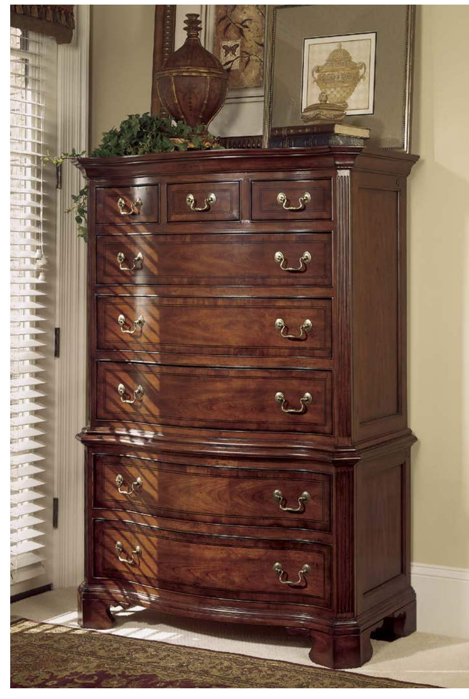
791-230 CHEST ON CHEST W42<sup>11</sup>/<sub>16</sub> D20 H60 Eight drawers

Opposite Page: 791-215 Drawer Chest W40 D20 H58 Nine drawers