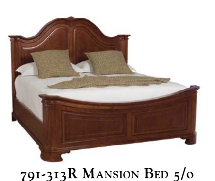
W67<sup>7</sup>/<sub>16</sub> D93<sup>3</sup>/<sub>8</sub> H62<sup>3</sup>/<sub>4</sub> Consists of:

-313* Mansion Headboard 5/0 W67<sup>7</sup>/<sub>16</sub> D<sub>7</sub>3/8 H62<sup>3</sup>/<sub>4</sub>