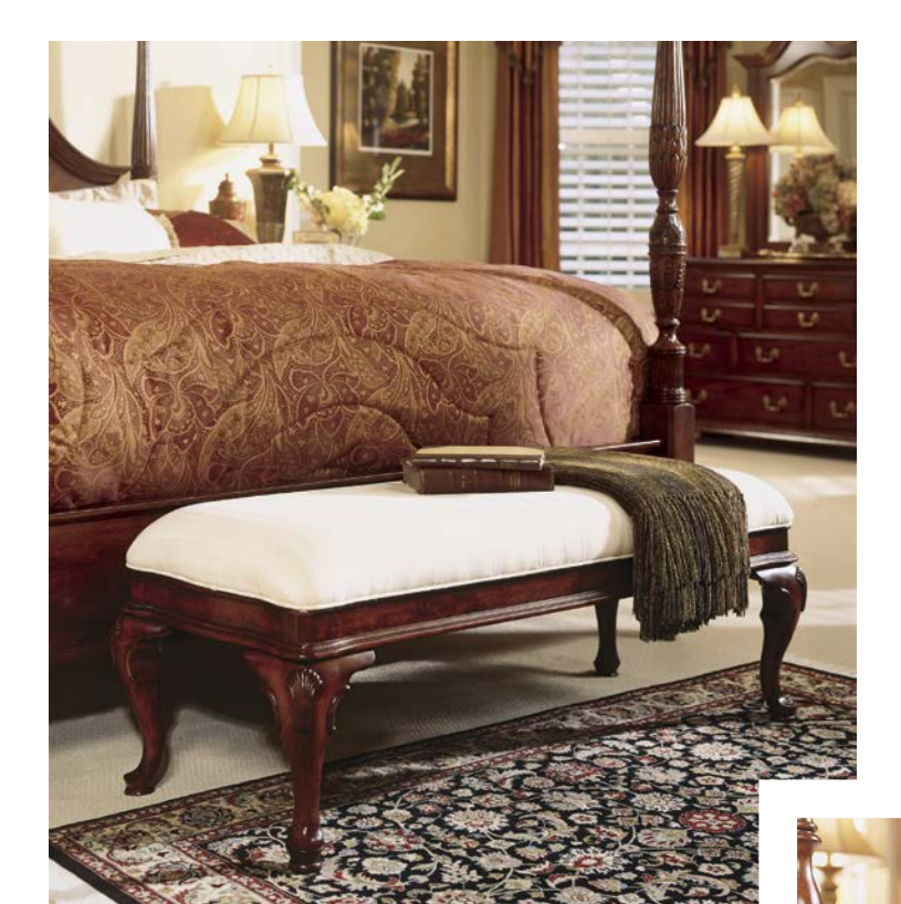
791-480 BED BENCH - KD W53<sup>9</sup>/16 D22<sup>1</sup>/<sub>4</sub> H19