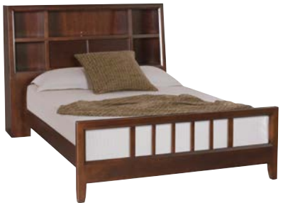
912-344R BOOKCASE BED COMPLETE 5/0 W67 D98 H52 Consists of: -343 BOOKCASE HEADBOARD 4/6-5/0 W67 D14 H52 Bored for frame, two sliding doors, door opening: W34 D6 H11, Four puck lights, touch lighting system, outside opening: W12 D7 H11 -324 SLAT FOOTBOARD 4/6-5/0 W63 D2 H22 -R42 WOODEN RAILS 4/6 W76 D3 H8 -SKI MATTRESS SUPPORT SYSTEM pages: 8, 9