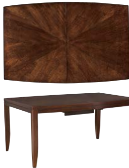
912-760N LEG TABLE-RTA W64 D44 H30 1 - 18 inch leaf, table extends to 82 inches pages: 10/11