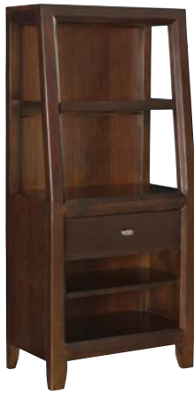
912-402 BOOKCASE NIGHTSTAND W24 D14 H52 One adjustable shelf, one drawer, one shelf on bottom. Shelf sizes - Top: W22½ D10½ H10½, Fixed Shelf: W22½ D10½ H10½, Bottom Shelf: W22½ D11½ H4-3/8 / H60 pages: 8/9