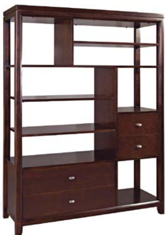
912-939 ETAGERE W52 D18 H73 Four drawers, seven oen compartments, two adjustable shelves on LSF above drawers, finished back pages: 24