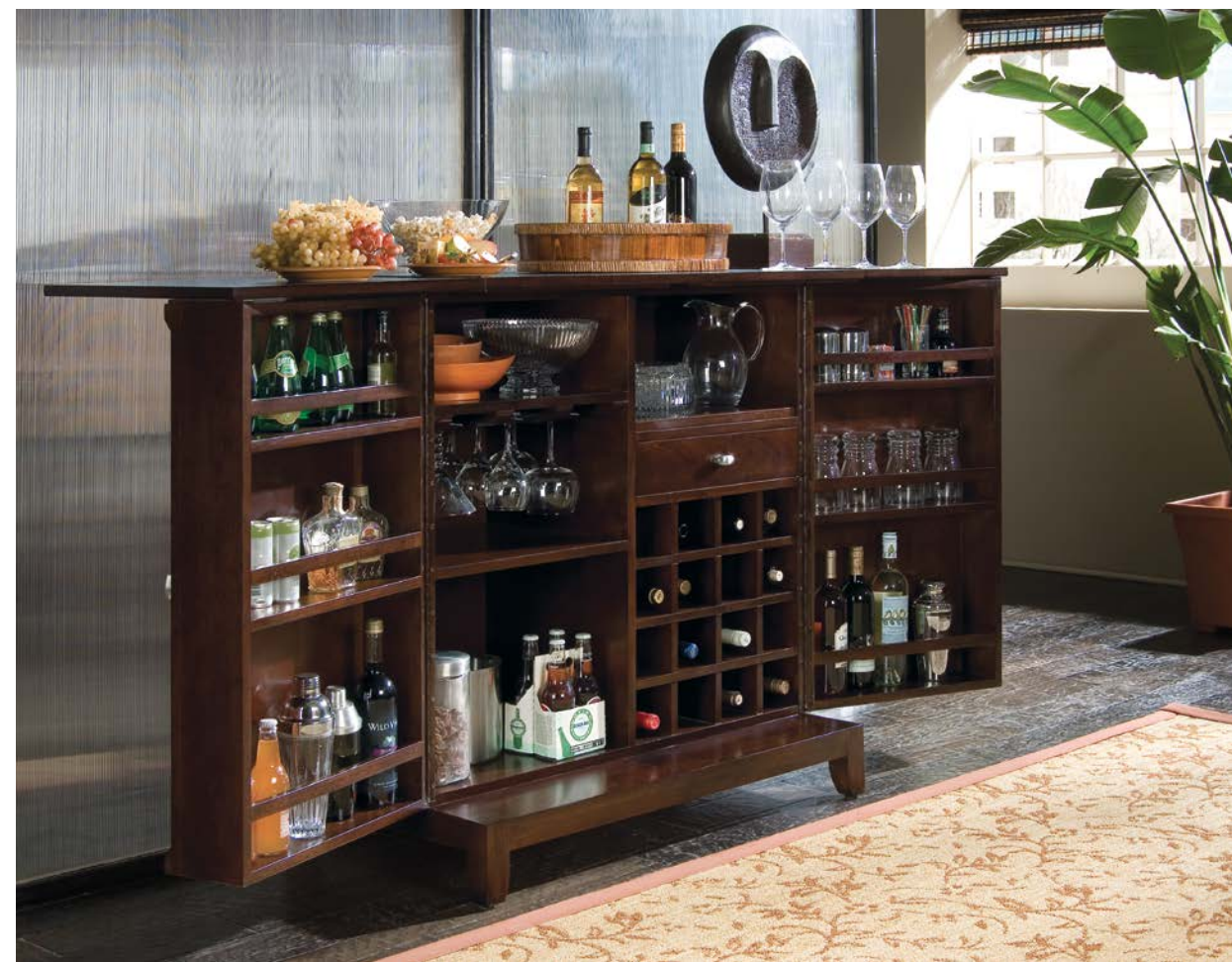
912-589 FLIP TOP BAR Open door detail