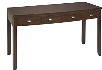
912-588 DESK - RTA W51 D24 H31 Three drawers, center drawer flips down pages: 18/19