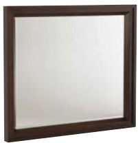
912-020 LANDSCAPE MIRROR W40 D2½ H35¼ Beveled mirror; mirror supports not included pages: 4, 6