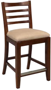
912-690 SPLAT BACK COUNTER BAR STOOL-KD W18 D19 H38 Seat Height: 25, Seat Depth: 16¾ Upholstered seat, wood back pages: 12