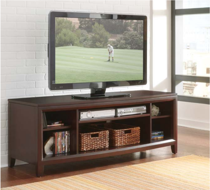
SHOWN LEFT AND ABOVE: 912-581 64” ENTERTAINMENT CENTER W64 D20 H23 One adjustable shelf in each compartment, three open compartments Center opening (without shelf): W33 D19½ H15 Side opening (without shelf): W12-5/8 D16 H15