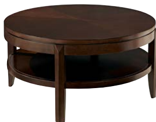
912-913 ROUND COCKTAIL TABLE DIA. 36 H19 One fixed shelf, Opening: Dia 34 H6 page: 3