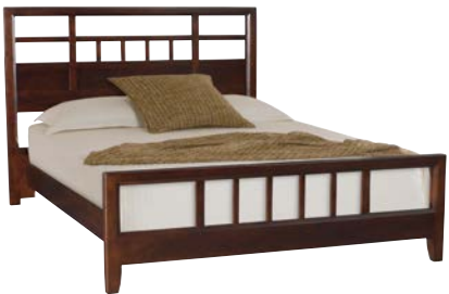
912-323R QUEEN SLAT BED 5/0 W63 D86 H52 Consists of: -323 SLAT BED HEADBOARD 4/6-5/0 W63 D2 H52 Bored for frame -324 SLAT BED FOOTBOARD 4/6-5/0 W63 D2 H22 -R42 HOOK ON RAILS 5/0-6/6 W82 D3 H6 -SKI MATTRESS SUPPORT SYSTEM pages: 4, 5