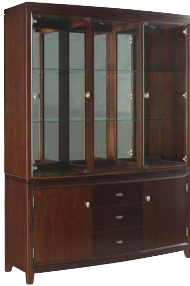
912-830R CHINA COMPLETE W60 D19 H80 Consists of: -831 CHINA DECK W60 D19 H50 Two doors, six adjustable glass shelves, three can light system, touch lighting -830 CHINA BASE W60 D19 H30 Two doors, three drawers, one adjustable shelf behind each door, silver tray pages: 14/15, 17