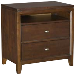
912-420 NIGHTSTAND W28 D18 H28¼ Two drawers, open compartment Compartment size: W23 D17 H3 page: 18/19