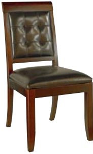
912-622 LEATHER SIDE CHAIR-KD W20 D24 H39 Seat Height: 20¼, Seat Depth: 18½ Upholstered seat and back Color: dark brown leather pages: 14/15, 18/19