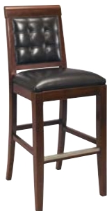
912-692 BAR HEIGHT STOOL - KD W19 D21 H46 Seat Height: 30, Seat Depth: 16¼ pages: 12