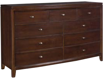
912-220 DRESSING CHEST W64 D20 H39¼ Nine drawers pages: 4, 6