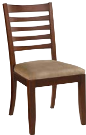
912-636 SPLAT SIDE CHAIR-KD W20 D23 H39 Seat Height: 20¼, Seat Depth: 19 Upholstered seat, wood back pages: 10/11, 15/16