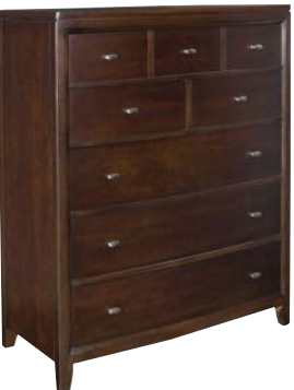
912-215 DRAWER CHEST W42 D21 H53¾ Five drawers page: 7