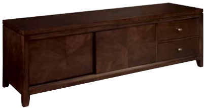
912-595 ENTERTAINMENT UNIT W72 D20 H24 Two drawers RSF, two sliding doors with one adjustable shelf behind each, cord exit hole, center foot, adjustable levelers Opening: W23 D17 H15 pages: 24/25