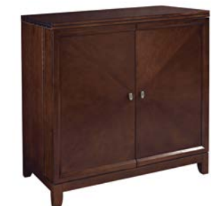
912-589 FLIP TOP BAR W39 D22 H42½ - WITH BOTH DOORS CLOSED W77 D22 H42½ - WITH BOTH DOORS OPEN Black laminate on flip tops, two doors with bottle storage, wine storage, one drawer on RSF, stemware holders RSF Opening: W18 D16 H10 LSF Two fixed shelves Top opening: W28 D26 H8 Bottom opening: W18 D16 H15 pages: 28/29