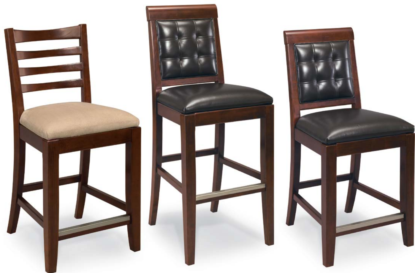
ABOVE: (LEFT TO RIGHT) 912-690 SPLAT BACK COUNTER BAR STOOL-KD W18 D19 H38 Seat Height: 25, Seat Depth: 16¾ Upholstered seat, wood back