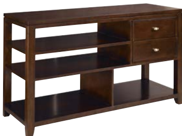
912-925 SOFA TABLE W52 D19 H32½ Two drawers Four open compartments, Top compartment: W30 D19 H6 Bottom compartment: W23 D19 H11 page: 21