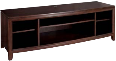
912-581 64" ENTERTAINMENT CENTER W64 D22 H23¾ One adjustable shelf in each compart- ment, three open compartments Center opening (without shelf): W33 D19½ H15 Side opening (without shelf): W12-5/8 D16 H15 Open compartments Inside: W26 H12 Outside: W9 H12 pages: 22/23