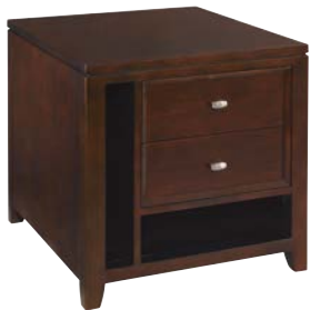
912-915 END TABLE W25 D28 H26½ Two drawers, one open compartment on bottom Compartment size: W17 D27 H5 Magazine opening on left: W3 D27 H19 pages: 5, 20