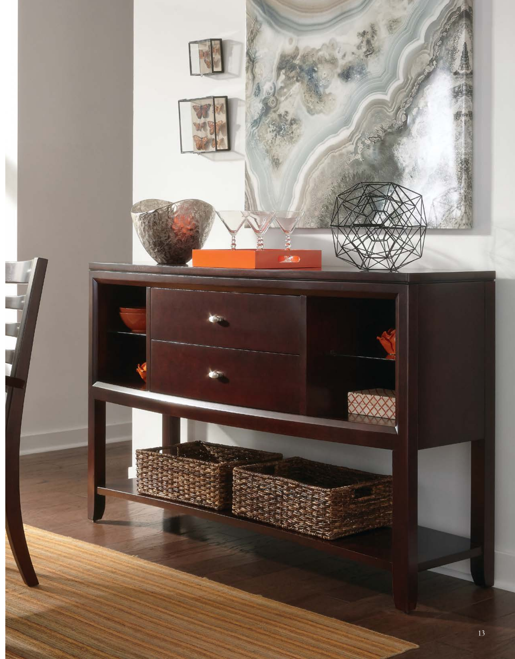
OPPOSITE PAGE: 912-850 SIDEBOARD/CREDENZA W60 D18 H38 Two glass shelves, two drawers, silver tray, opening size with glass: W12¾ H14, Shelf size on bottom: W56 D15¾ H12¾