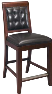
912-691 LEATHER COUNTER-STOOL-KD W18 D21 H40 Seat Height: 24, Seat Depth: 17¾ Packed 1 Per Carton pages: 12