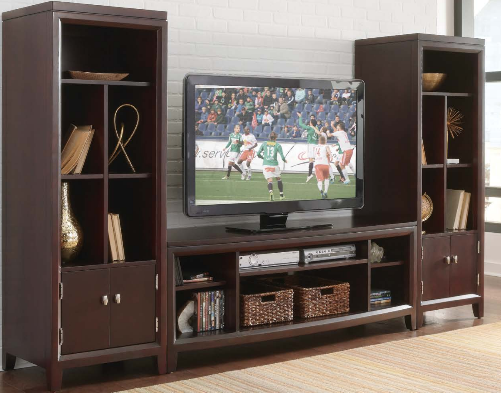
912-580 WALL UNIT (2 SHOWN IN IMAGE) W22 D20 H65¼ Two doors with one adjustable shelf, center upright with two adjustable shelves, fixed shelf, one open compartment in top, top opening: W18-7/16 D17 H9; 2nd opening from the top with the shelf in the center position: W18-7/16 D17 H15½, 3rd opening from the top with the shelf in the center position: W18-7/16 D17 H14½, interior size behind door with the shelf in the center position: W20-7/8 D15-7/8 H6-5/8