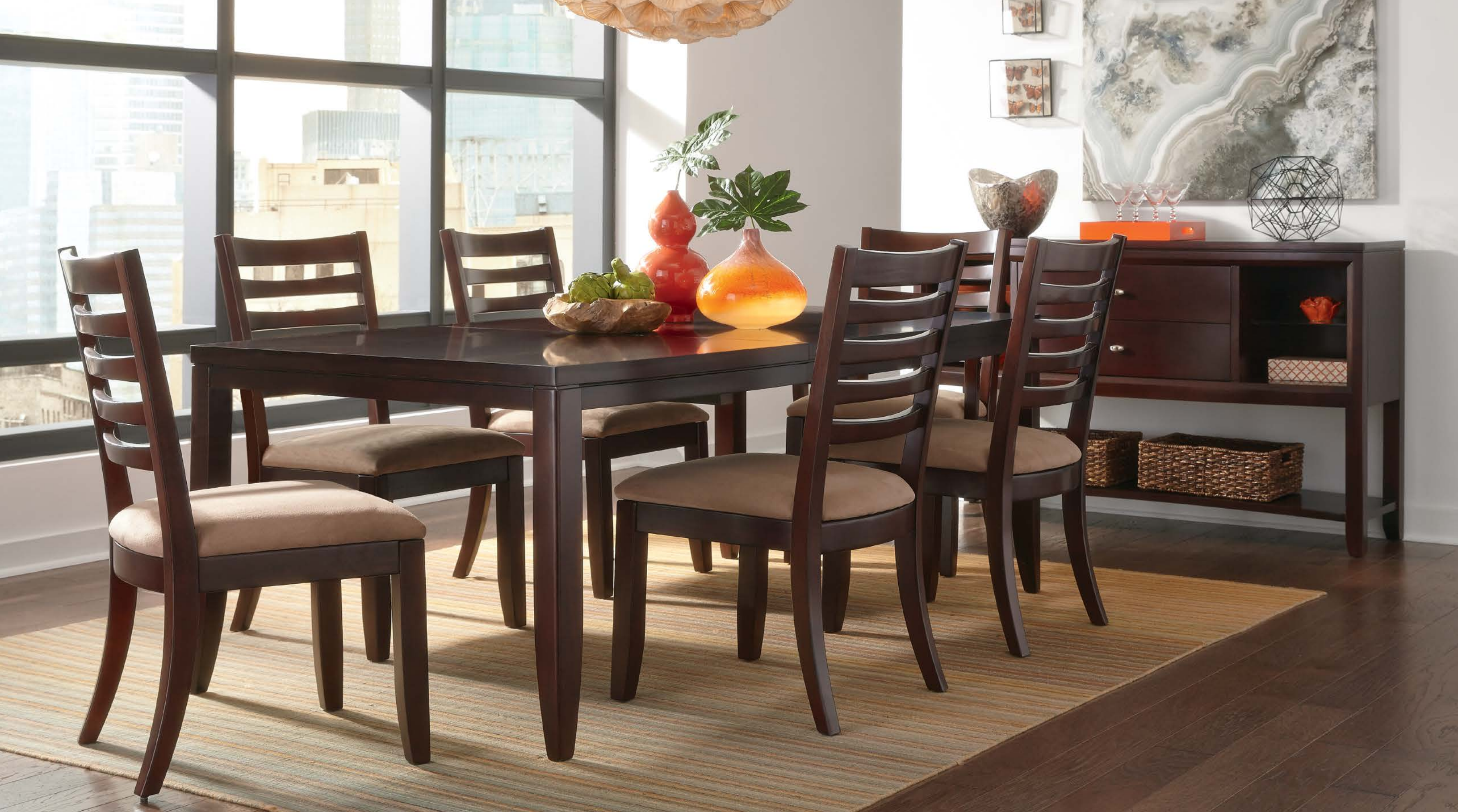
912-636 SPLIT SIDE CHAIR W20 D23 H39 Seat Height: 20¼ Upholstered seat, wood back