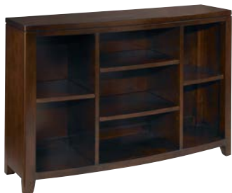
912-926 BOOKCASE CONSOLE W44 D14 H32-1/8 Four adjustable shelves Top outside: W11 D13 H11 Center top: W17 D13 H7 Bottom outside: W11 D13 H13 Center bottom two: W17 D13 H9 pages: 26