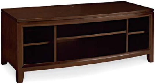
912-585 51” ENTERTAINMENT CENTER W51 D22 H21 One adjustable shelf in each compartment, Three open compartments: Inside Compartment: W26 H12 Outside Compartments: W9 H12