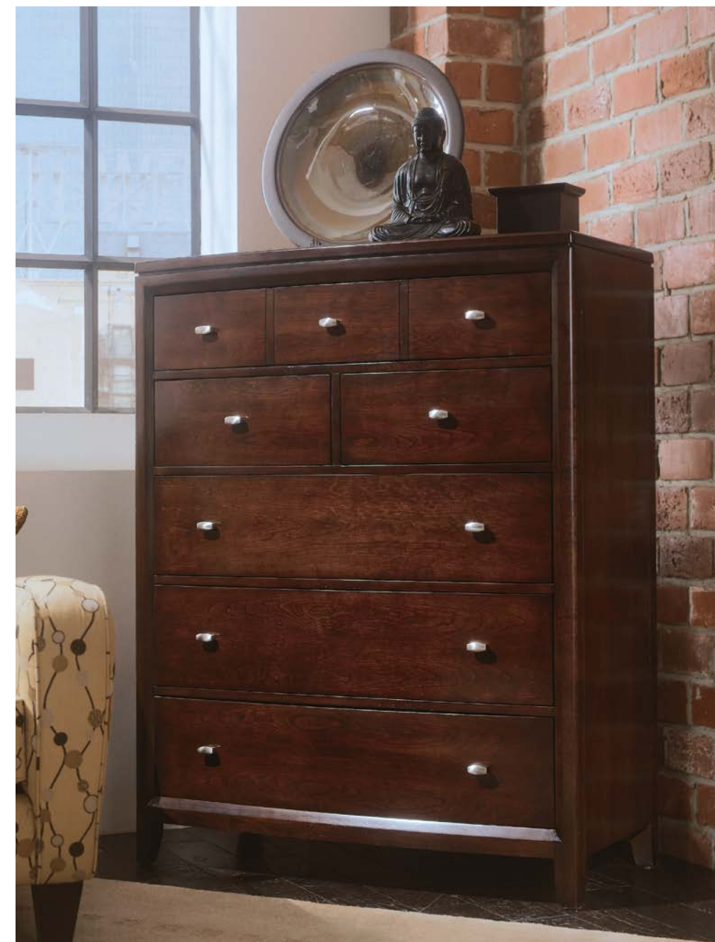
912-215 DRAWER CHEST W42 D21 H53¾ Five drawers

OPPOSITE PAGE: 912-020 LANDSCAPE MIRROR W40 D2 H35¼ Beveled mirror; mirror supports not included