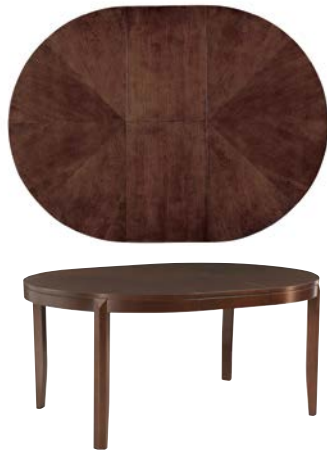
912-701N ROUND LEG TABLE-RTA DIA 48 H30 1 - 16 inch leaf, table extends to 64 inches pages: 16/17