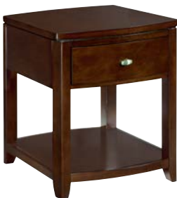
912-916 END TABLE - RTA W20 D22 H26 One drawer, one fixed shelf Opening: W16 D22 H13 pages: 3, 24