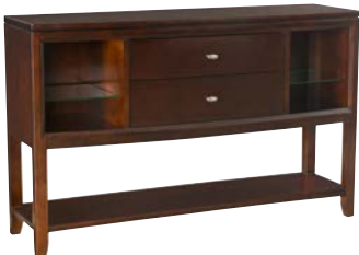
912-850 SIDEBOARD/CREDENZA W60 D18 H37½ Two glass shelves, two drawers, silver tray, Shelf size on bottom: W56 D15¾ H12¾, Each opening with glass: W12¾ H14 pages: 13