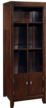
912-580 WALL UNIT W22 D20 H64¾ Two doors with one adjustable shelf, center upright with two adjustable shelves, fixed shelf, one open compartment in top, top opening: W18-7/16 D17 H9; 2nd opening from the top with the shelf in the center