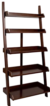
912-940 WALL STORAGE W35 D19 H76 Five shelves 1: W30½ D7-7/8 2: W30½ D9-7/8 3: W30½ D12¼ 4: W30½ D14¾ 5: W30½ D17-3/8 pages: 27