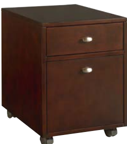
912-941 FILE CADDY W16 D22 H22 Two drawers, file storage in bottom drawer, casters pages: 18