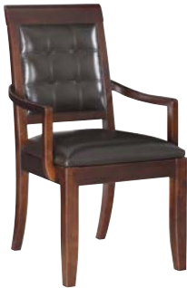
912-623 LEATHER ARM CHAIR-KD W20 D23 H39 Seat Height: 20¼, Seat Depth: 18½, Arm Height: 25 Upholstered seat and back Color: dark brown leather pages: 14/15