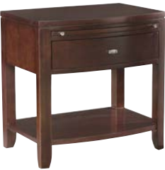
912-400 LEG NIGHTSTAND W26 D18 H26¼ One drawer, one fixed shelf, pull out tray Shelf size: W25½ D18 H11⅝ page: 5