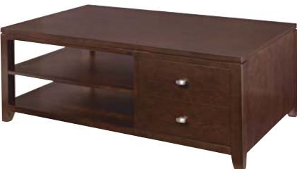
912-910 COCKTAIL TABLE W50 D30 H20 Two drawers, two fixed shelves Each opening: W28 D30 H7 pages: 20/21