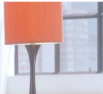
ABOVE (LEFT TO RIGHT): 912-400 LEG NIGHTSTAND W26 D18 H26¼ One drawer, one fixed shelf, pull out tray Shelf size: W25½ D18 H11⅝