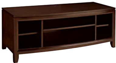
912-585 ENTERTAINMENT CENTER W51 D22 H21 One adjustable shelf in each compartment, three open compartments Inside: W26 H12 Outside: W9 H12 pages: 23